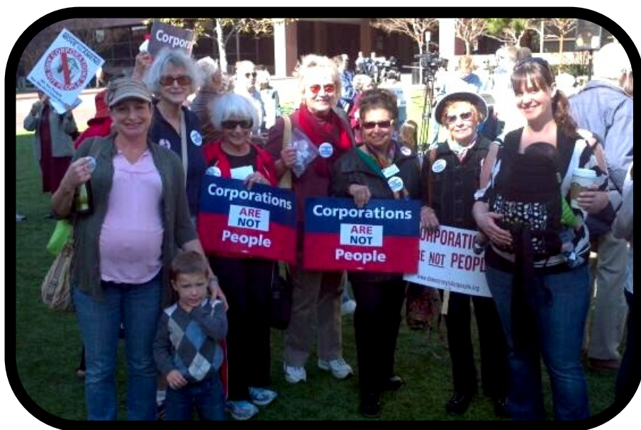
LWVSD members at the January 20 Occupy the Courts protest in San Diego — for more photos see our web/e-mail version